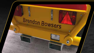
Optional Extra: Rear Forklift Points