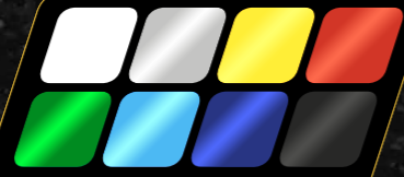
Large choice of Tank & Chassis Colour Combinations