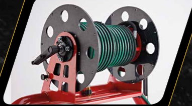
Optional Extra: Manual or 12V DC Electric Hose Reels for 30M - 100M of HP Hose