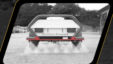
Optional Extra: Rear mounted spray bar for dust suppression