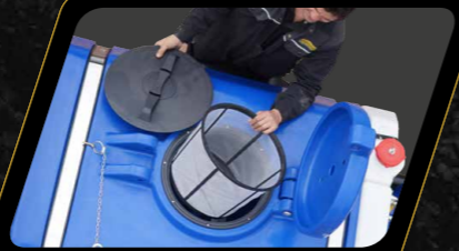
Lockable Hinged Tank Lid with removable Basket Filter