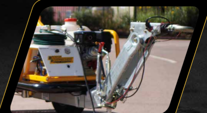
Choice of 50mm Ball or Eye couplings - Alko Adjustable Hitch available