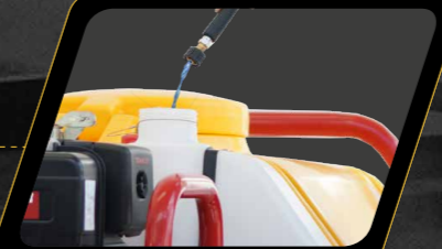
Integral Anti-Freeze & Detergent Tanks