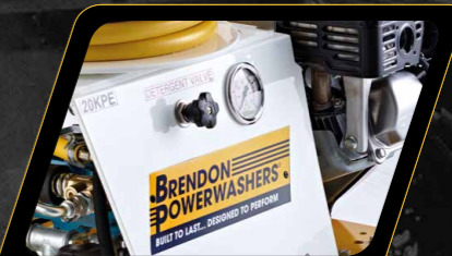
Polypropylene Canopy with Detergent Control Valve and Pressure Gauge