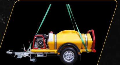
3 Point Lifting Points