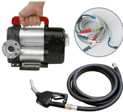
BATTERY KIT BI-PUMP