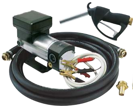
BATTERY KIT OIL