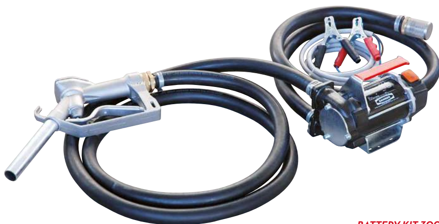
BATTERY KIT 3000