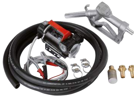
BATTERY KIT 3000 INLINE